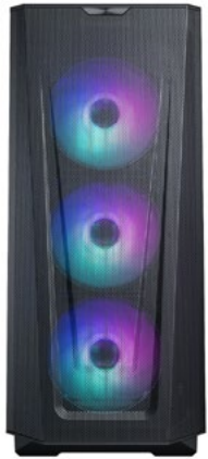
IMAGE GALLERY BLACK VERSION