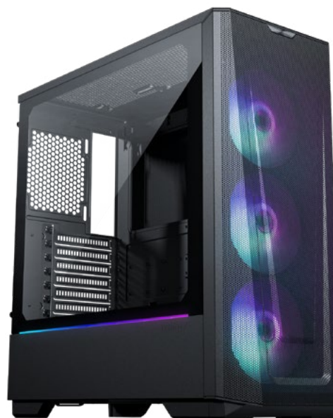
ECLIPSE G360A (SATIN BLACK)

Like all Phanteks lighting products, the integrated D-RGB lighting is simple to control with pre-programmed lighting effects and requires no software when synchronizing with compatible motherboards and expanding with more D-RGB products.