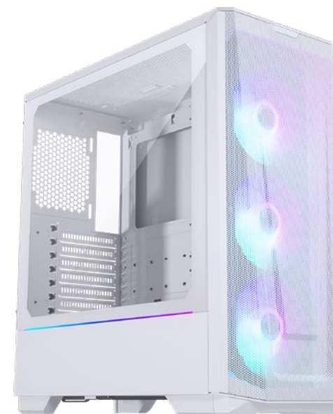
ECLIPSE G360A (MATTE WHITE)