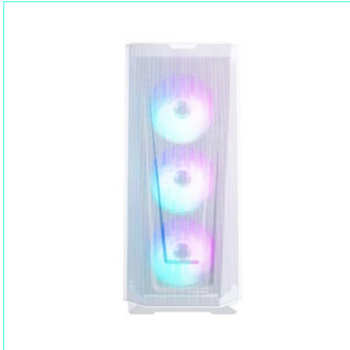
IMAGE GALLERY WHITE VERSION